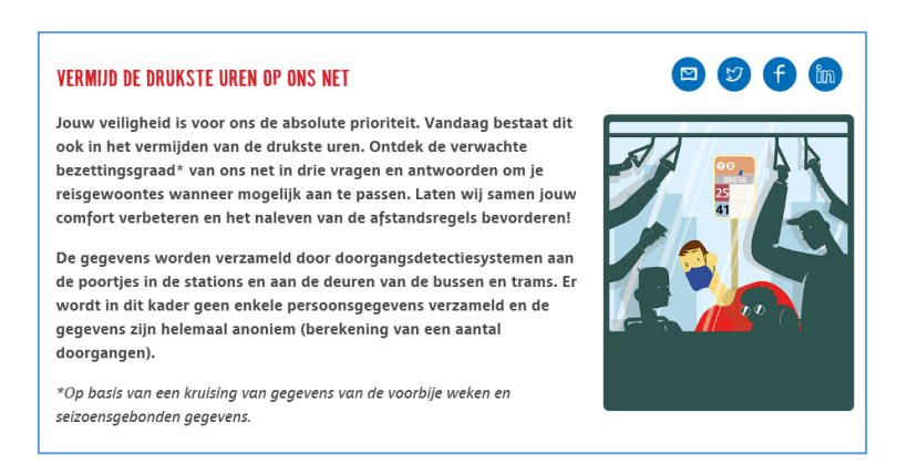
Figure 2: Example of Corona use case at STIB-MIVB.