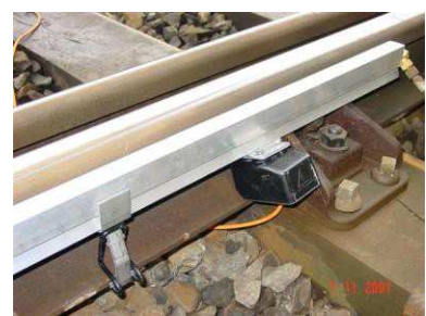
Snow-free railroad switcher by point heater (1 st photo) and details of point heater (2 nd /3 rd photo)

The pictures above were taken at a (regular) heavy rail network. moBiel has piloted modern point heating on its light rail network (see best practice 4).