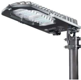
LED lighting used for street lighting

This planned initiative is conducted by RATP without support of T2K.